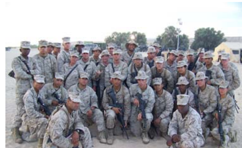
Motor Transport "Leading the way"

It was a pleasure to meet those of you who were able to join us at the Battalion's family day and pre-deployment brief. Keep those questions coming! Your Marine may not know the answer, but we guarantee we can get it for you. Lastly, congratulations to both our newly married Marines and our new parents.