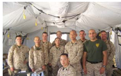
Chaplain supporting the BAS