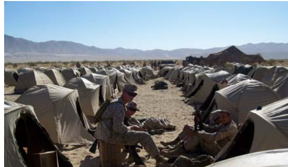
Unwinding in "Tent City"

ing events, as well as preparing and packing both the company's equipment, as well as supporting our adjacent companies in preparing their equipment. The Marines are eager to get out to the desert and train, and demonstrate what they've learned, prior to our upcoming deployment.