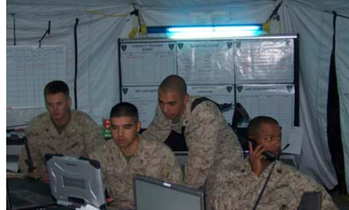
Communication at its finest!