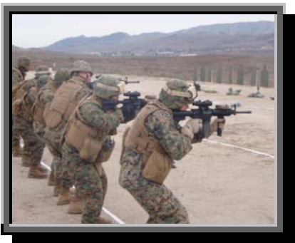
Motor T Marines hone combat marksmanship (COINFEX)