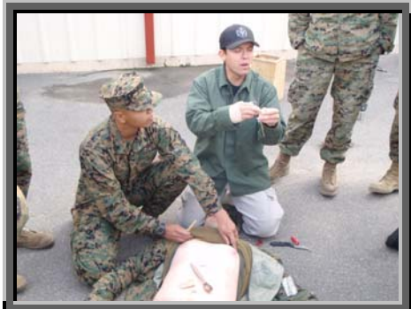
H&S Marines get a class on using common MRE components to treat wounds. (COINFEX)

We must actively work to ensure that the families are well prepared for the deployment while their Marine or Sailor is away. Accomplishing this before departure will ensure that our Marines and Sailors are fully focused on and committed to mission success.